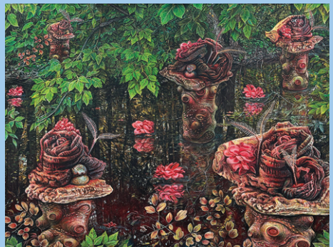
Kristy Deetz: Cyano-Syphon , 2023; Re-Flower , 2024.